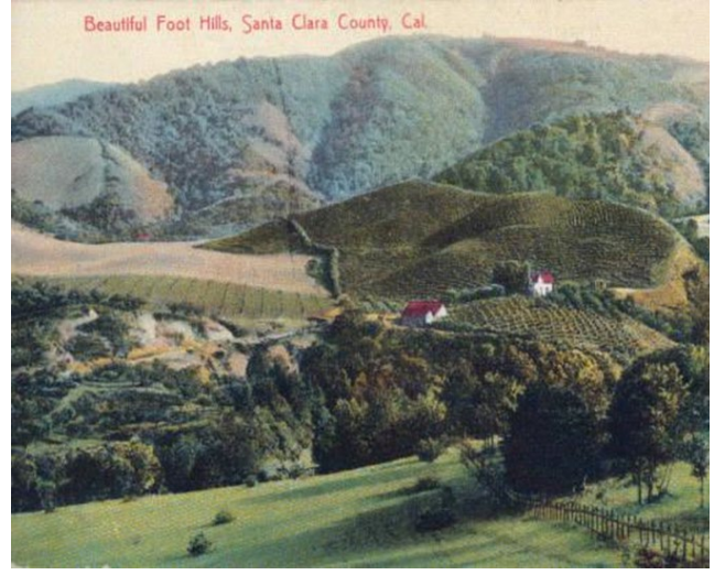
Santa Clara Agricultural Landscape