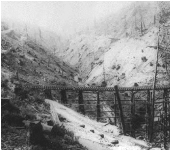
San Vicente Redwoods near Davenport at the turn of the 20th century.