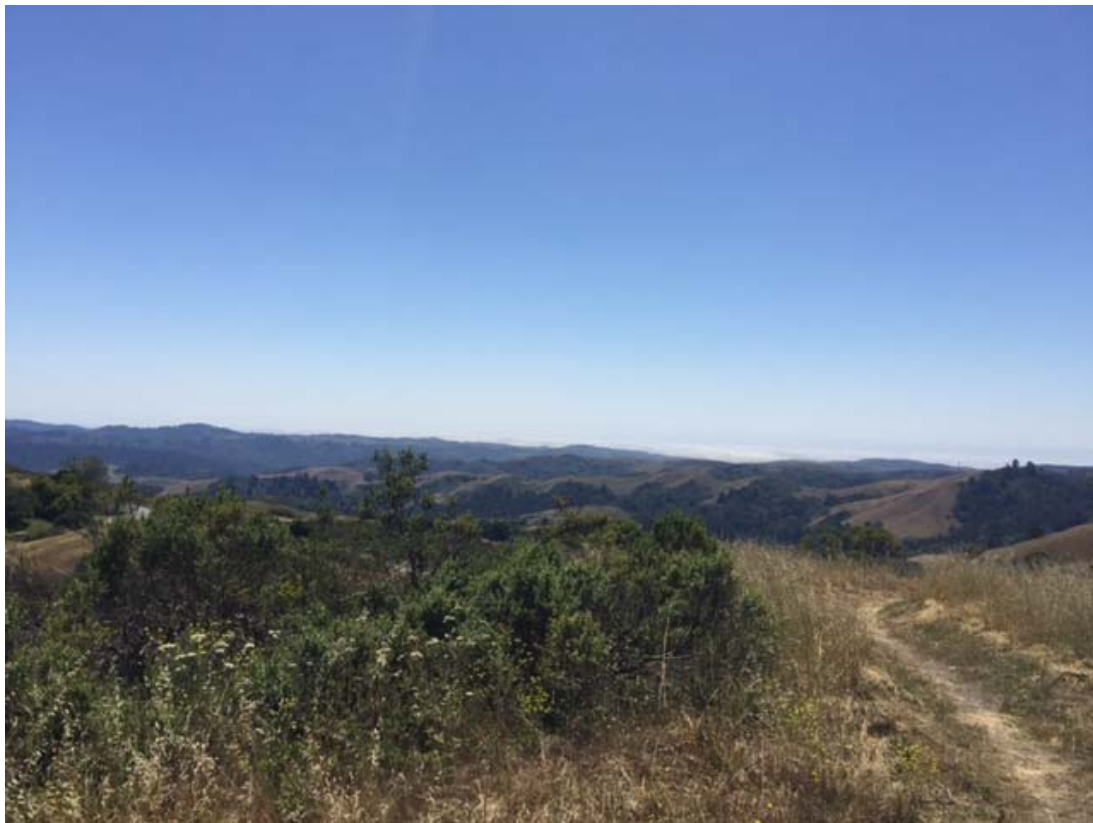
View from Herb Grench knoll looking south