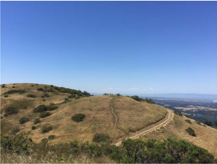
Herb Grench Knoll with bench looking north (toward Palo Alto/Menlo Park)