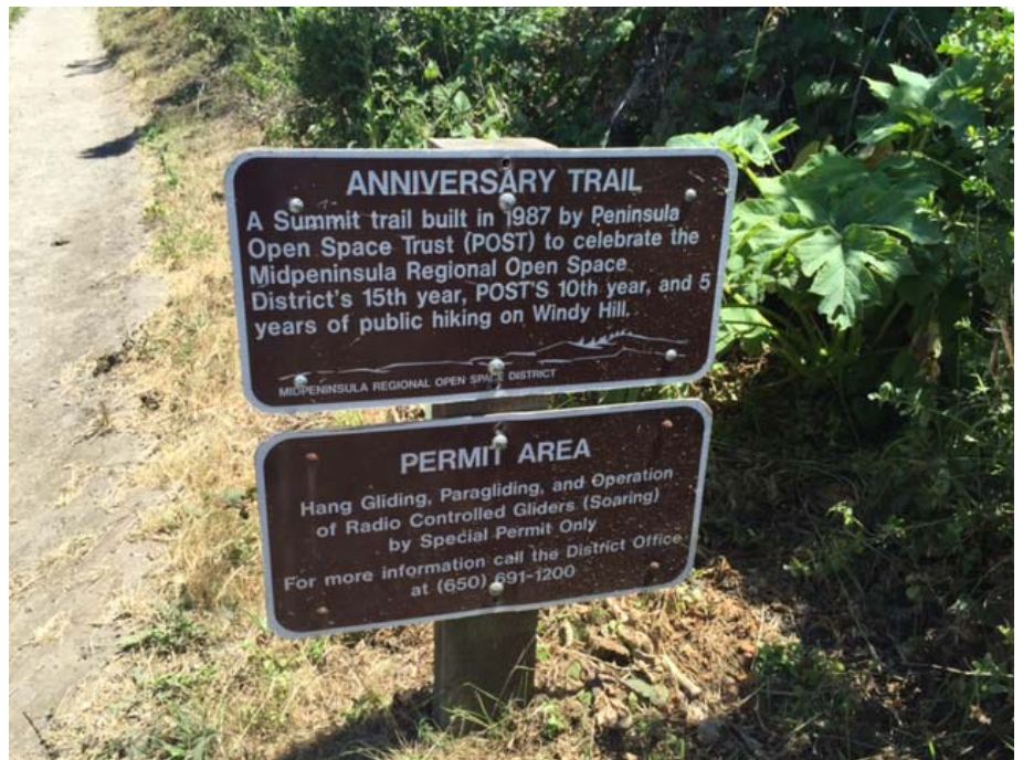
Sign of Anniversary Trail (New sign to be created referring to Herb Grench/Anniversary Trail name)