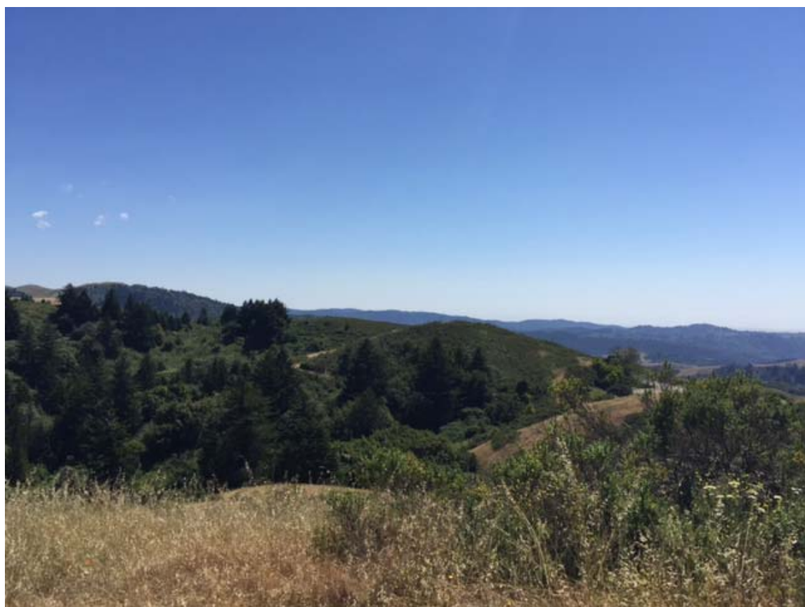
View from Herb Grench knoll looking east