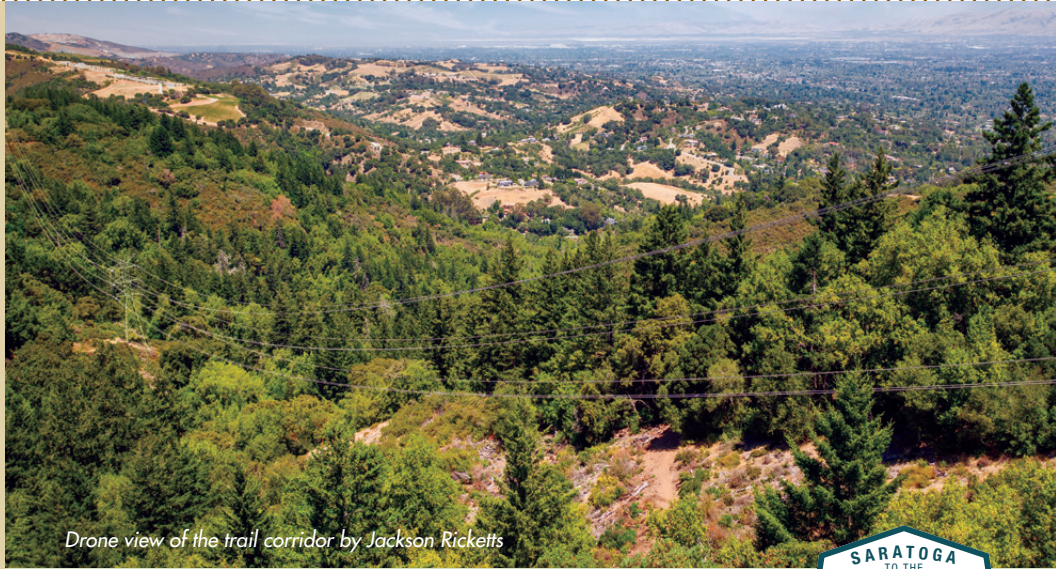
Drone view of the trail corridor by Jackson Ricketts