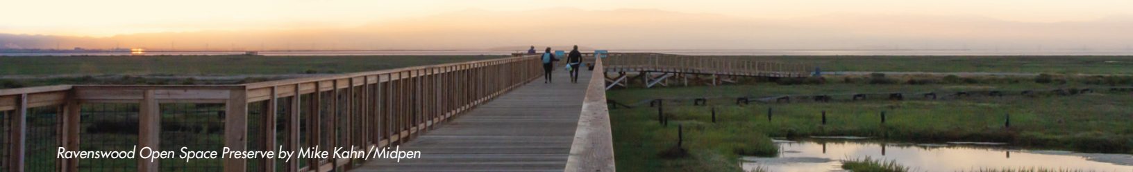
Ravenswood Open Space Preserve

Thankfully, we have each other and our natural open spaces to support our collective path to a better future.