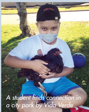
A student finds connection in a city park by Vida Verde

lifelong connections to nature are often kindled in childhood, however, some of today's youth have few opportunities to explore and experience undeveloped natural landscapes. A funding recipient of Midpen's new grantmaking program, Vida Verde Nature Education, is working to change that.