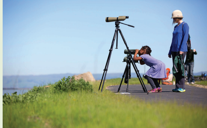
Ellie Van Houtte Birdwatching at Ravenswood Open Space Preserve