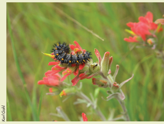
Rancho San Antonio Open Space Preserve

Look deep into nature, and then you will understand everything better.