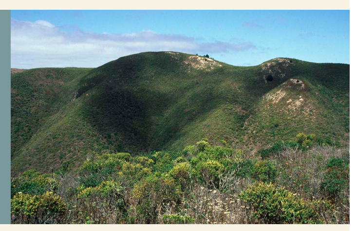
Miramontes Ridge Open Space Preserve

Gateway to the Coast Public Access, Stream Restoration and Agriculture Enhancement