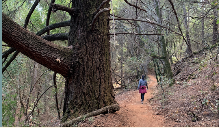
Saratoga-to-the-Sea Trail (Brian Malone)