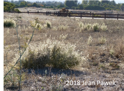
Spanish broom ( Spartium junceum )