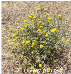
Yellow starthistle ( Centaurea solstitialis )