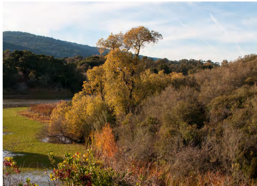
Jasper Ridge.

While much of the research on rangeland carbon is focused on soil carbon sequestration, livestock grazing in California influences carbon storage through the distribution of woody and herbaceous vegetation. In Jasper Ridge, 25 years of shrub encroachment was found to increase ecosystem carbon storage by 40 metric tons per acre, or roughly 1.6 tons of carbon per acre per year (Zavaleta and Kettley, 2006). While much of this increase was in aboveground vegetation, soil carbon stocks were seen to increase as well, a finding that aligns with other California-based studies that have found no differences in soil carbon storage between grazed and ungrazed plots, but up to 2x the carbon storage in soils beneath woody vegetation relative to open