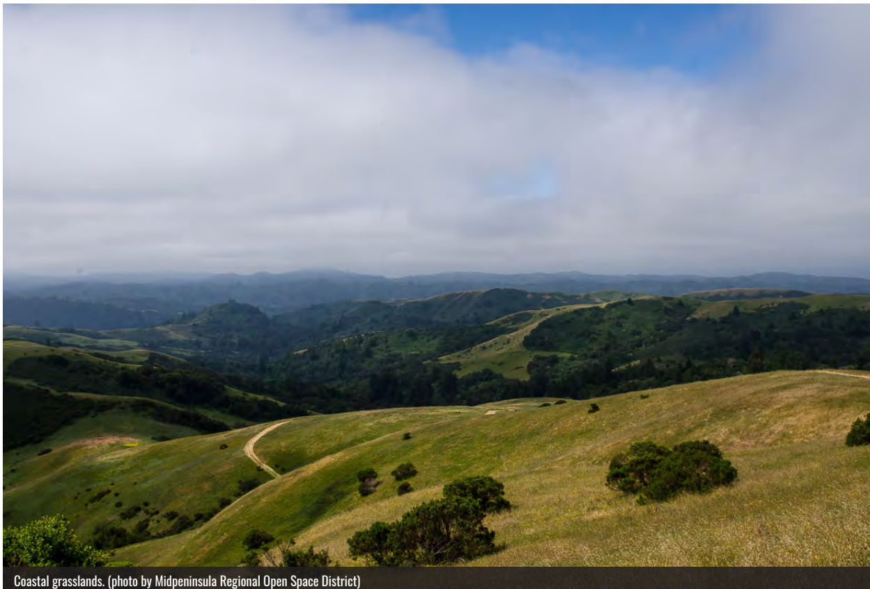
Coastal grasslands.

The historical composition of the region's grassland vegetation is not well understood, but ecological evidence and historical accounts suggest that the grasslands of the San Mateo coast were once dominated by native perennial bunchgrasses such as purple needlegrass ( Stipa [Nasella] pulchra ) and California oatgrass ( Danthonia californica ), with interspersed annual forbs (Evetts and Bartolome, 2013). Studies evaluating the effects of livestock grazing on these native perennial grasses have reported mixed findings, with grazing shown in some cases to have no effect on native perennial cover or richness (Hayes and Holl, 2003a; White, 1967), or in other cases to either increase or decrease native perennial cover and establishment success, depending on the specific grass species, site, experimental treatment, and soil characteristics (George et al., 2013; Hatch et al., 1999). In general, the effects of grazing on native perennial grasses in California's Mediterranean grasslands are understood to be small relative to effects on native forbs or introduced species (reviewed in Bartolome et al., 2014; Huntsinger et al., 2007; Stahlheber and D'Antonio, 2013). Few of the existing studies, however, occurred on the San Mateo Coast or other coastal grasslands (e.g., Hatch et al., 1999; Hayes and Holl, 2003a), making it challenging to draw conclusions specific to Midpen lands.