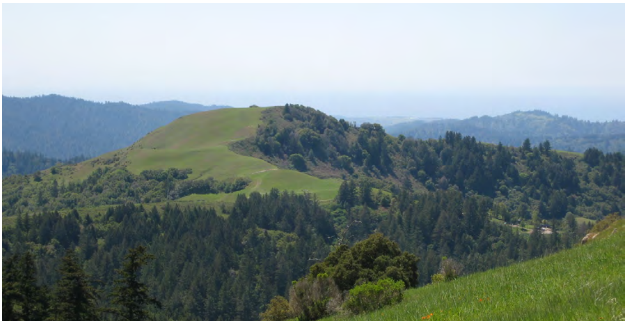
Coastal grasslands.

While numerous studies have evaluated the effects of grazing on native grassland biodiversity, variations in study design and site-specific outcomes make it challenging to draw clear and specific conclusions. Observational paired-plot studies such as Hayes and Holl (2003a) capture long-term, regional-scale differences between grazed and ungrazed sites, but obscure potentially important effects of variable grazing practices. With more focused experimental studies, the scope of inference is limited to the specific system and the specific experimental treatment, and results of short-term grazing manipulation studies may differ from long-term effects (e.g., Hayes and Holl, 2003a vs. Hayes and Holl 2003b). Livestock exclosure experiments test the effects of livestock removal , but may not pertain equally to the effects of grazing per se . Finally, the effects of grazing on grassland biodiversity may depend on a particular site's land management history. Historical cultivation, for example, which was widespread in grasslands of the San Mateo coast, can influence the effects of grazing on grassland vegetation communities (Stromberg and Griffin, 1996).