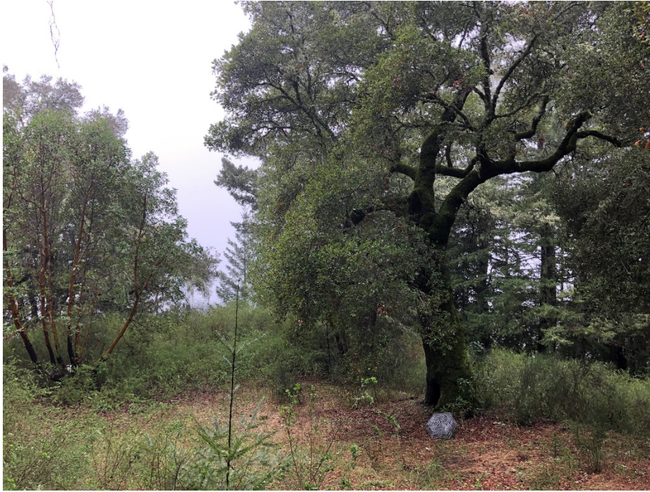
Site location is marked by the umbrella