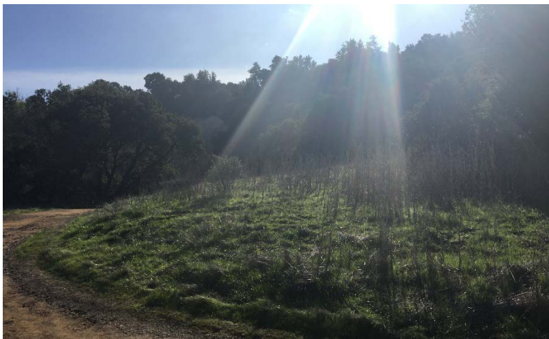
Photos of proposed bench location