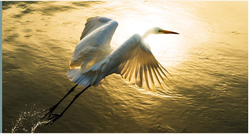
Stevens Creek Shoreline Nature Area