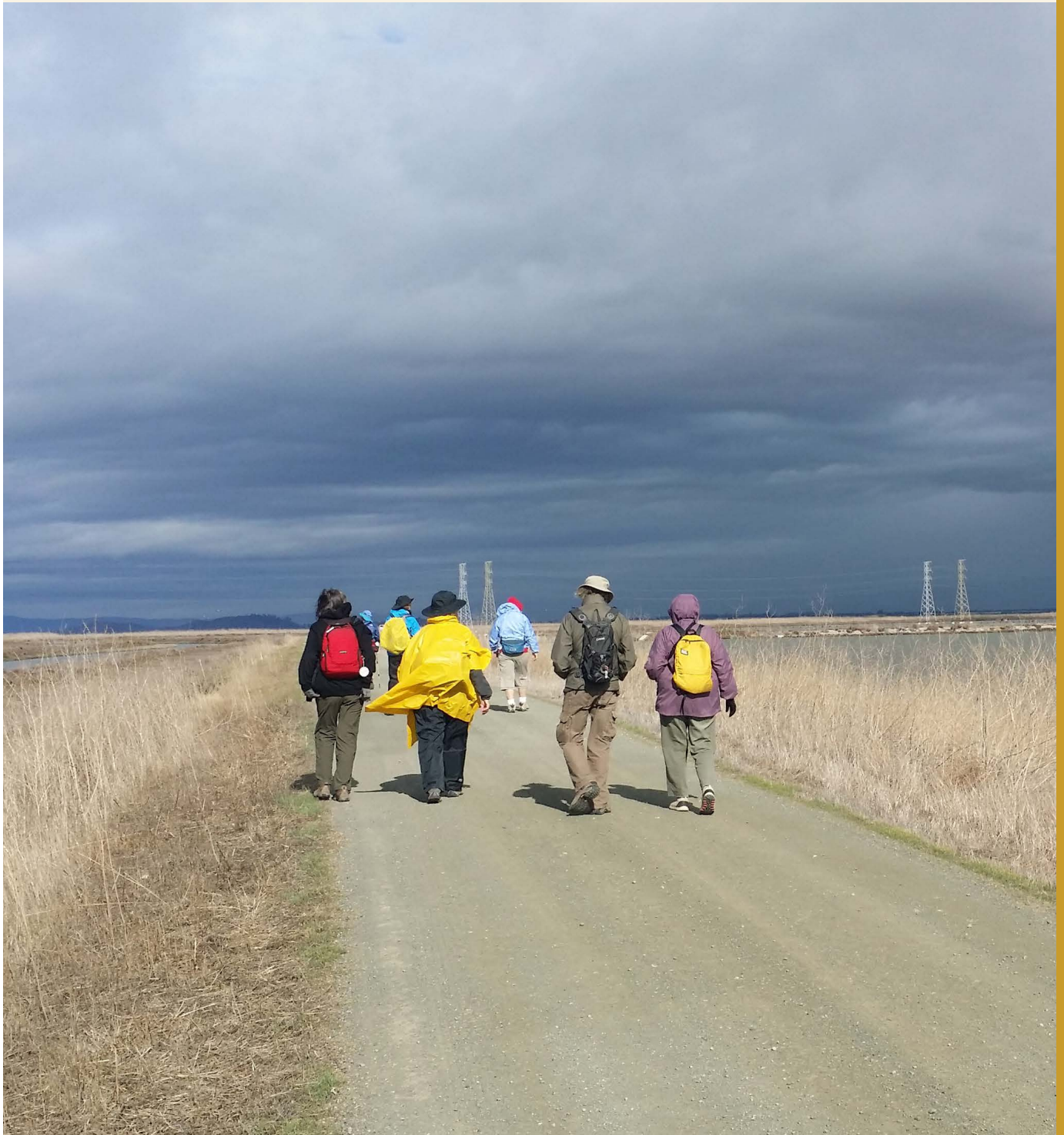
Stevens Creek Shoreline Nature Area