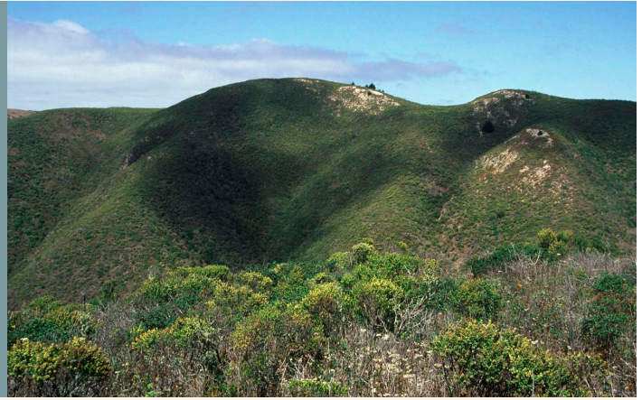
Miramontes Ridge Open Space Preserve (Elaina Cuzick)