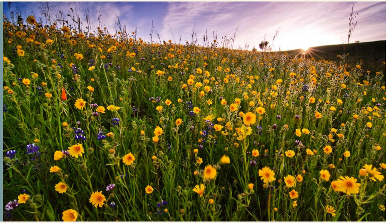
Russian Ridge Open Space Preserve (Vaibhav Tripathi)