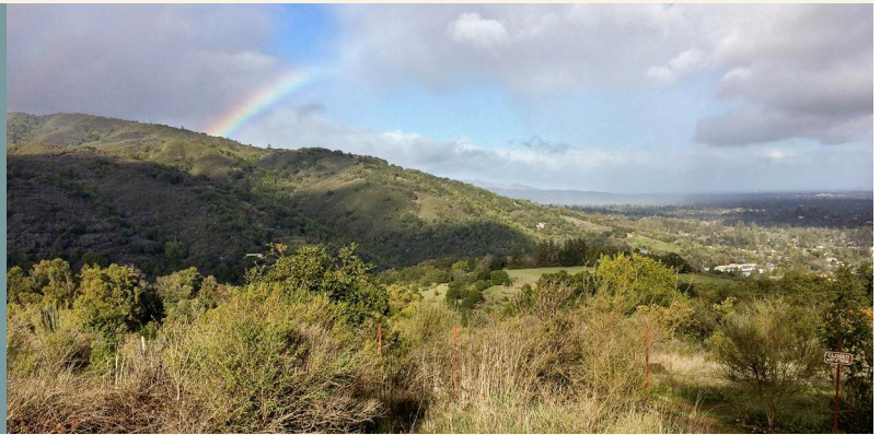
St. Joseph's Hill Open Space Preserve