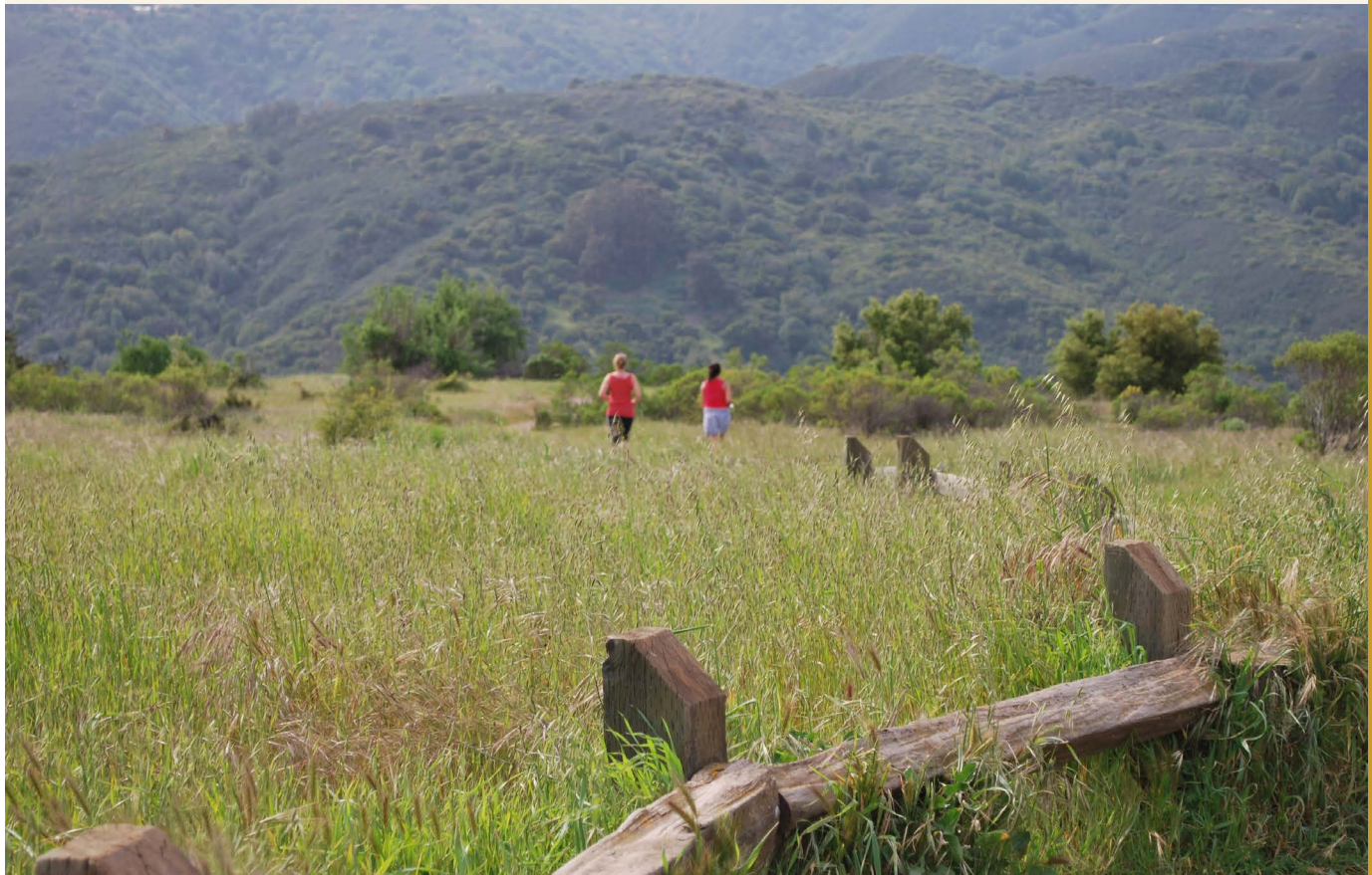
St. Joseph's Hill Open Space Preserve (Midpen)