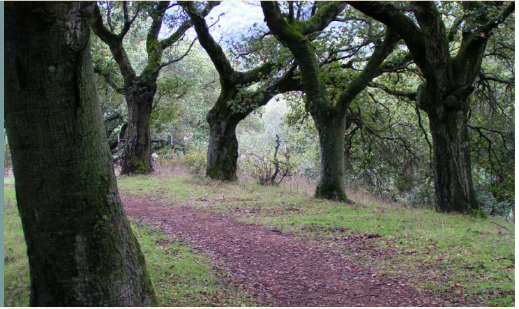
Pichetti Ranch Open Space Preserve (Tom Cochrane)